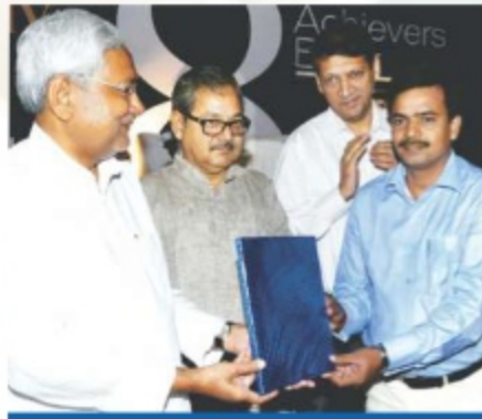
Receiving the Achiever Award from C.M. of Bihar, Sri Nitish Kumar