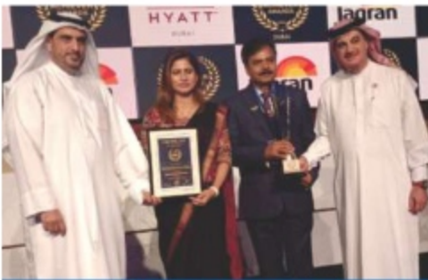
In Dubai 2022 GOAL won the award of "TRUSTED MEDICAL PREPARATION" in the category of Excellence in Capacity Building