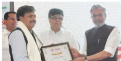
Receiving the Guru Samman Award from then Deputy C.M. of Bihar Late Sushil Kumar Modi, Organised by Dalnrik Bhaskar