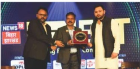
Receiving award from Deputy Chief Minister Mr. Tejaswi Yadav