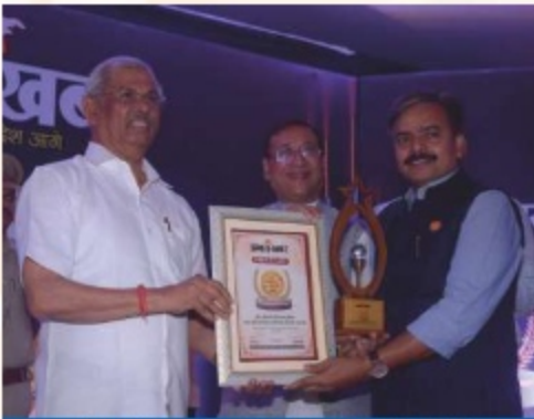
Receiving 'Shining Star of Bihar' Award for 2023 Organised by Prabhat Khabar