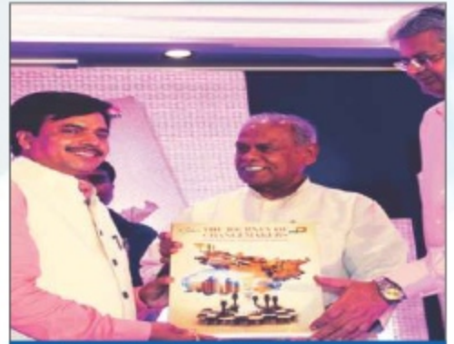
Receiving the 'Rising Entrepreneur of Bihar Award' from then C.M. of Bihar Sri Jitan Ram Manjhi