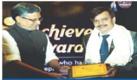
Receiving the Achiever Award from then Deputy C.M. of Bihar Late Sushil Kumar Modi