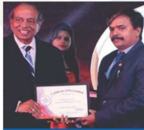
Times Education Icons (Best Medical Entrance Preparation Institute)