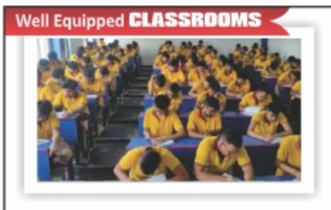
Well Equipped CLASSROOMS